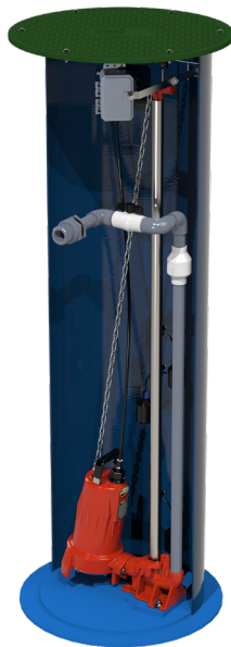
Simplex 2484LSG & 3084LSG