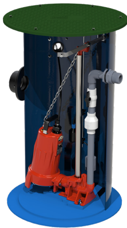
Simplex 2448LSG & 3048LSG