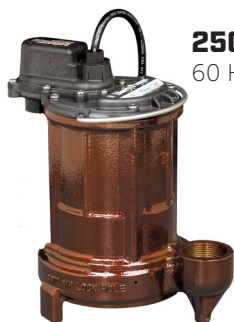
250-Series 60 Hz