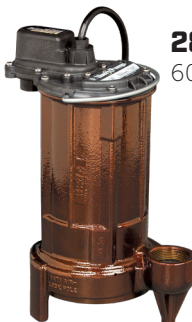
280-Series 60 Hz