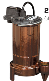
290-Series 60 Hz