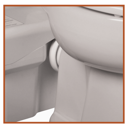
CleanConnect™ Seal eliminates unsightly rubber accordion style couplers and hose clamps for connection of toilet to the macerator unit! Simply slide the macerator unit with a robust integral seal onto the hub of the toilet. Macerator sits closer to toilet for a more professional appearance!