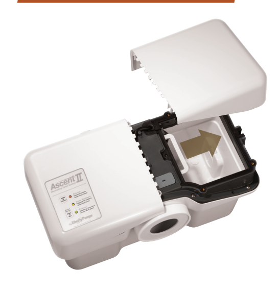
Integral heavy-duty rubber gaskets