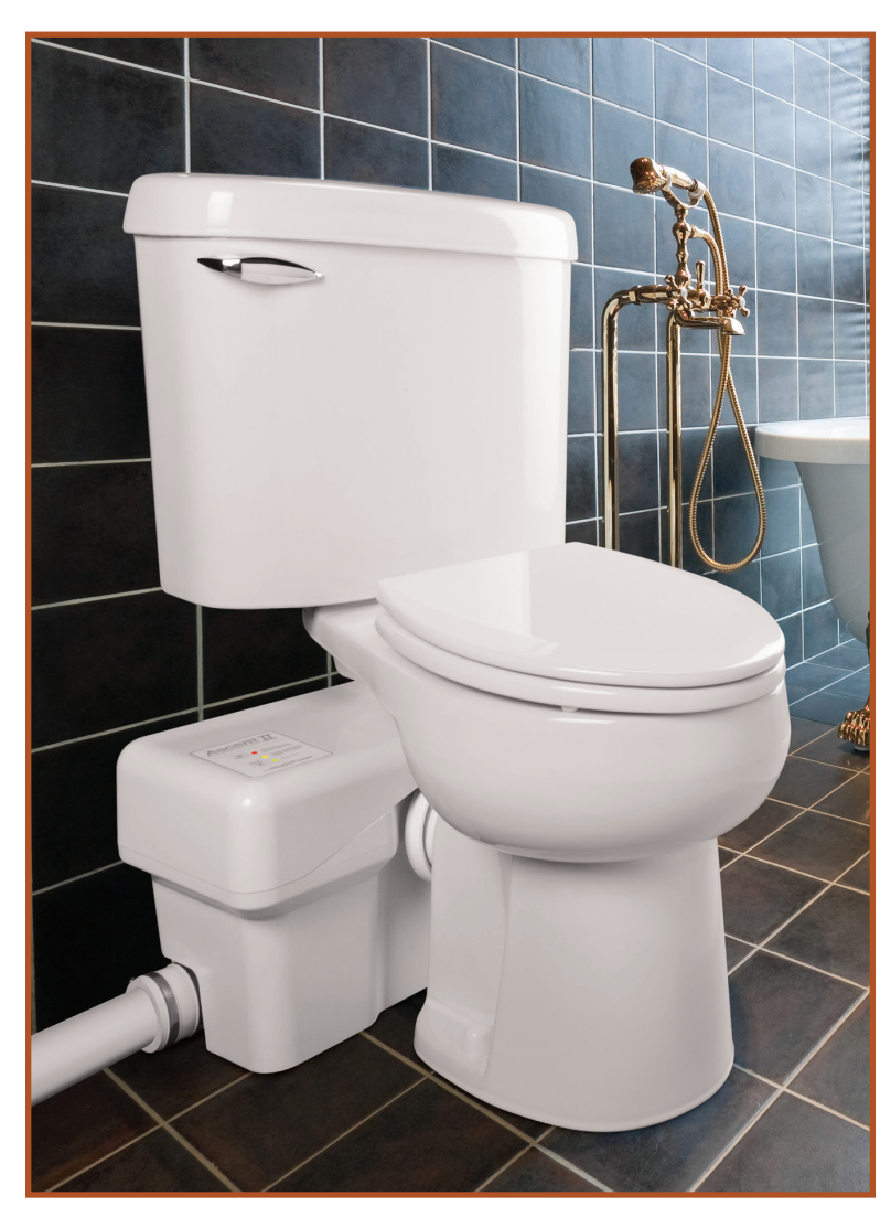
Patent: See www.LibertyPumps.com/patents