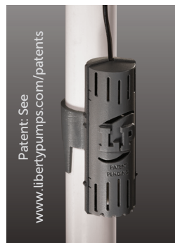
Snap-on Compact Float Model ALM-P1-EYE (sump pump applications)

Super-bright LED alarm ring - Increases visibility