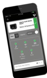
Normal Status Screen