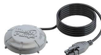
Puddle Sensor Model ALM-PK-EYE (for floor level water sensing)