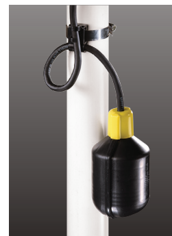
Wide Angle Float Model ALM-2-EYE (recommended for sewage applications)